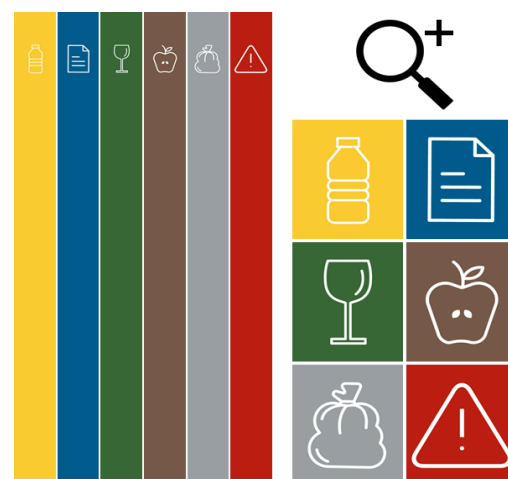
70 - labels h 85 cm